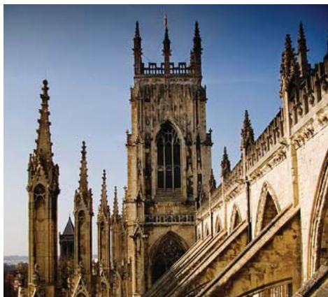
York Minster, UK