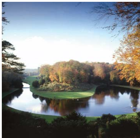
Studley Royal Water Garden, © National Trust Photographic Library/Andrew Butler