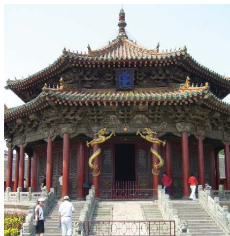
Shenyang Imperial Palace, China

These aspirations were translated into an Australian national framework by the Burra Charter, the Australian National Charter, 1979 while the idea of universality was strengthened by the 1972 World Heritage Convention with its concept of outstanding universal value for properties that might be seen part of the 'world heritage of mankind as a whole' which thus translated universal ideas to places perceived to be of universal value.