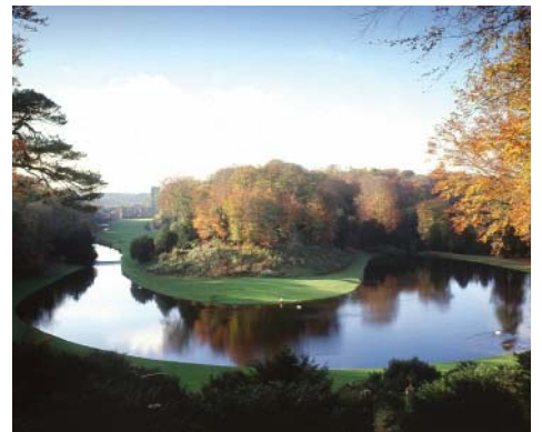
Studley Royal Water Garden

Is there such a thing as a global conservation philosophy for cultural heritage? Should there be? Or should cultural heritage conservation reflect cultural diversity? The 1965 Venice Charter was based on the idea that the principles guiding the preservation and restoration of ancient buildings should be agreed and laid down on an international basis, with each country being responsible for applying them within the framework of their own culture and traditions.